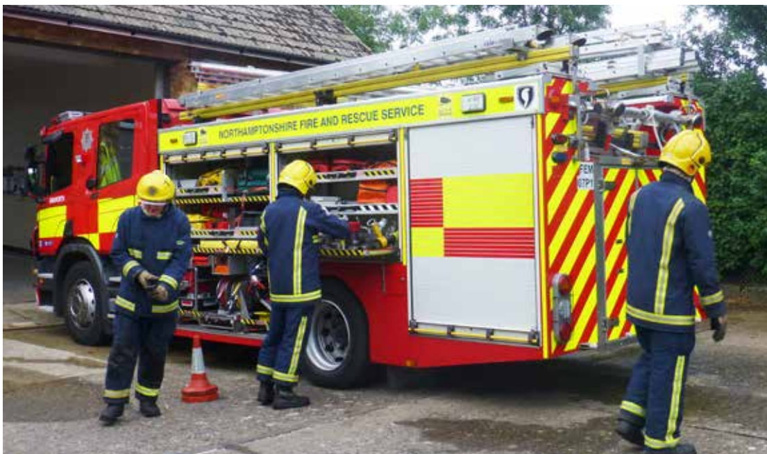
Brixworth's firefighters respond to twice as many traffic accidents as fires

Unfortunately, a large number of new recruits drop out, so the