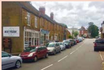
Even on a Monday morning with the shops closed, the road was packed with parked cars

On Monday 3rd August, members of the Planning Inspectorate for the UK visited the Pet Shop at 130 Northampton Road, to conduct a site visit in response to an appeal by the owner to the rejection by Daventry District Council of his application to change the shop to a takeaway.